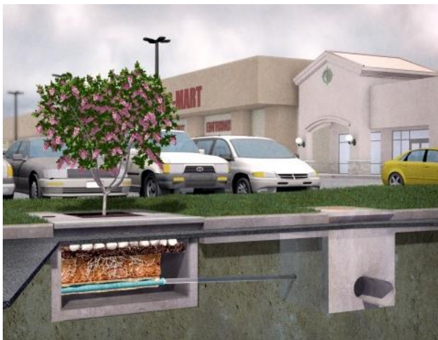
Figure 1: Tree Box Filter

For more information about Proposition 84, please contact John L. Hunter and Associates at (562) 802-7880, Ext. 222 or email info@jlha.net .